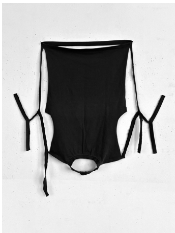
OVERLAP #02 t-shirt, cotton, dark green 2023