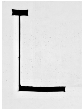
untitled (PROTEST) #04 t-shirt, wool, dark green 2026

Donna Haraway, Staying with the Trouble , Duke University Press, 2016 Donna Haraway, Staying with the Trouble , Duke University Press, 2016 Donna Haraway, Staying with the Trouble , Duke University Press, 2016