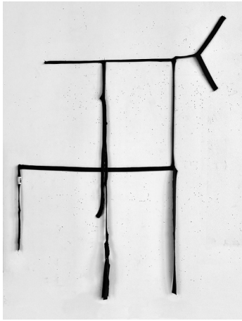
Se-lections (ESCAPE) t-shirt, cotton, bright green 2023